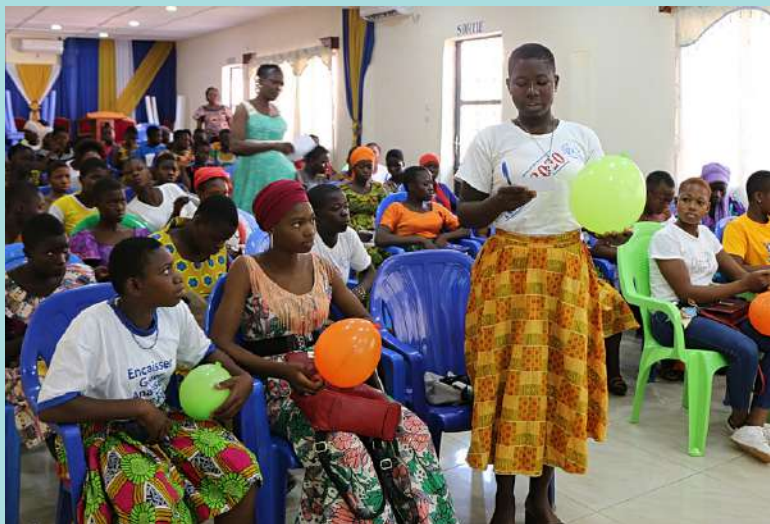
Photos: Dignity Events in Ivory Coast, Madagascar and Tajikistan

We thank God for opening doors we never imagined possible! A big well done to our global partners! You inspire us with your passion and commitment!